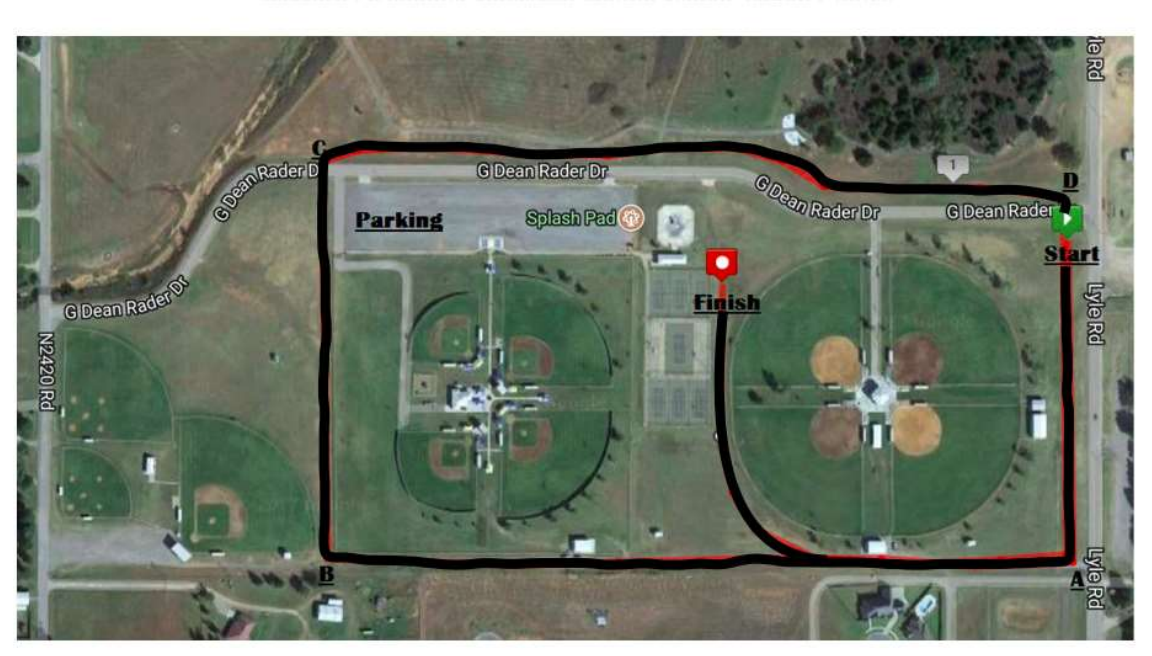
START \rightarrow A \rightarrow B \rightarrow C \rightarrow D \rightarrow A \rightarrow FINISH