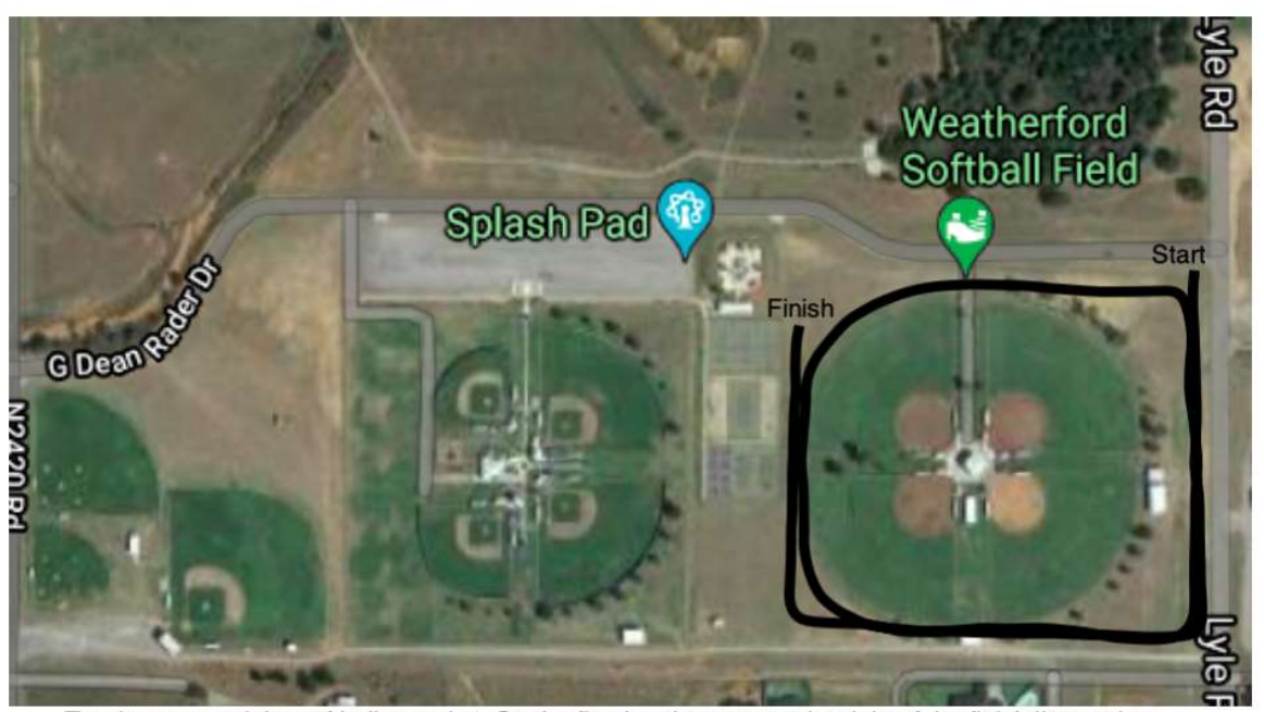
Two laps around the softball complex. On the first lap they stay to the right of the finish line and on the second lap they will go into the finish chute.

Weatherford Sand Plum Invitational- MS Girls 1 Mile Course